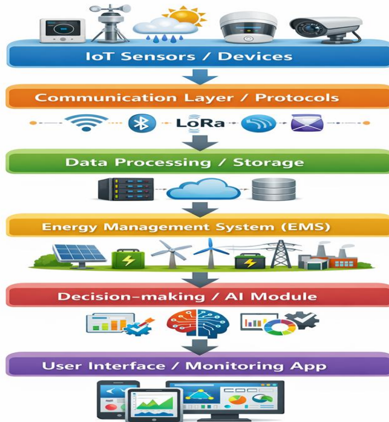
Figure 2: Architecture of the IoT-based Smart Energy Management System.

Figure (2) presents the overall architecture of the IoT based smart energy management system, where data is collected from IoT sensors, transmitted through the communication layer, processed and managed by the EMS, and analyzed using AI based decision making, with real time monitoring and control provided through the user interface.